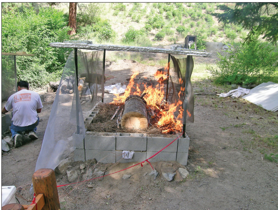
Researchers test how log size and state of decay affect soil heating. They found that rotten logs burned longer than the sound logs, leading to high soil temperatures and deeper soil heating.