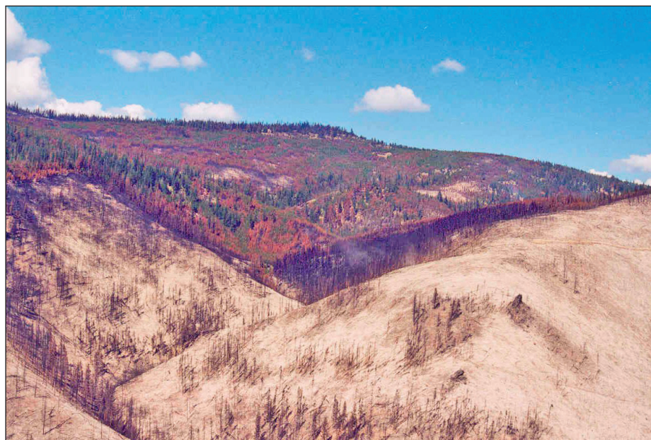
David W. Peterson

Unlike western Cascades forests, where centuries can pass between wildfires, wildfires historically occurred every 5 to 40 years in the dry, low-elevation forests of the eastern Cascades. “The fires in these forests were traditionally what we would call low- or mixed-severity fires that mostly burned fuels on the ground,” Peterson says. “These fires are kind of like moving campfires, burning up a bunch of fuel—understory shrubs, dried needles, and wood sitting on the ground—but not killing many trees.”