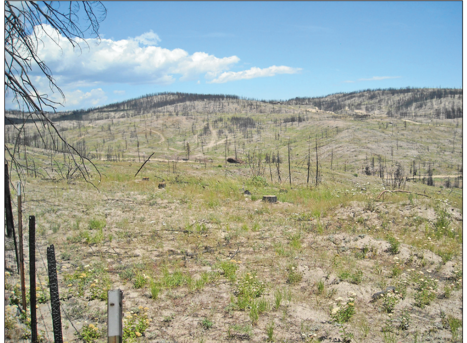
One year after postfire logging on a site that burned during the 2014 Carlton Fire in Washington.