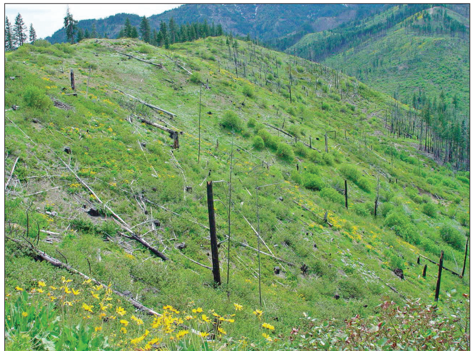
Fuels and vegetation recovery 10 years after high-severity wildfire and postfire logging following the 1994 Rat-Hatchery Fire near Leavenworth, Washington, in the Okanogan-Wenatchee National Forest.